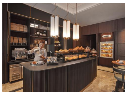
Clockwise above from left: Porter Lounge, MOGA's Bar Counter, Madison's Grab & Go Counter

Nested atop the roof to bring stunning views facing Marina Bay Sands, visitors are presented with El Chido , a Mexican-themed swim-up bar. Flaunting an infinity swimming pool and entirely accessible to the public, El Chido evokes the feel of summer get-aways with Mexican and South American dishes, smashable cocktails and a backdrop of punchy Latino beats in collaboration with DJ-Dispensary , perfect for festive gatherings.