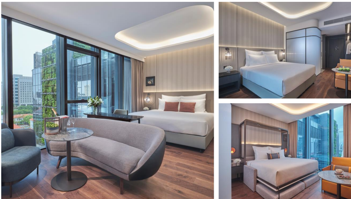
Clockwise above from left: Studio Suite with Pool View, Deluxe Room, Deluxe Room with Murphy Bed

Sized at 25m 2 , the Deluxe and Executive Rooms offer smartly optimized layouts for all guests, with the latter situated on higher floors for sweeping views of the cityscape. Anchored as the definitive stay, the ultra-premium Studio Suite (33m 2 ) houses additional amenities that include a bathtub, sofa seating, Nespresso Creatista Plus and a true tankless filtration system by Wells' Singapore that dispenses hot or chilled water.