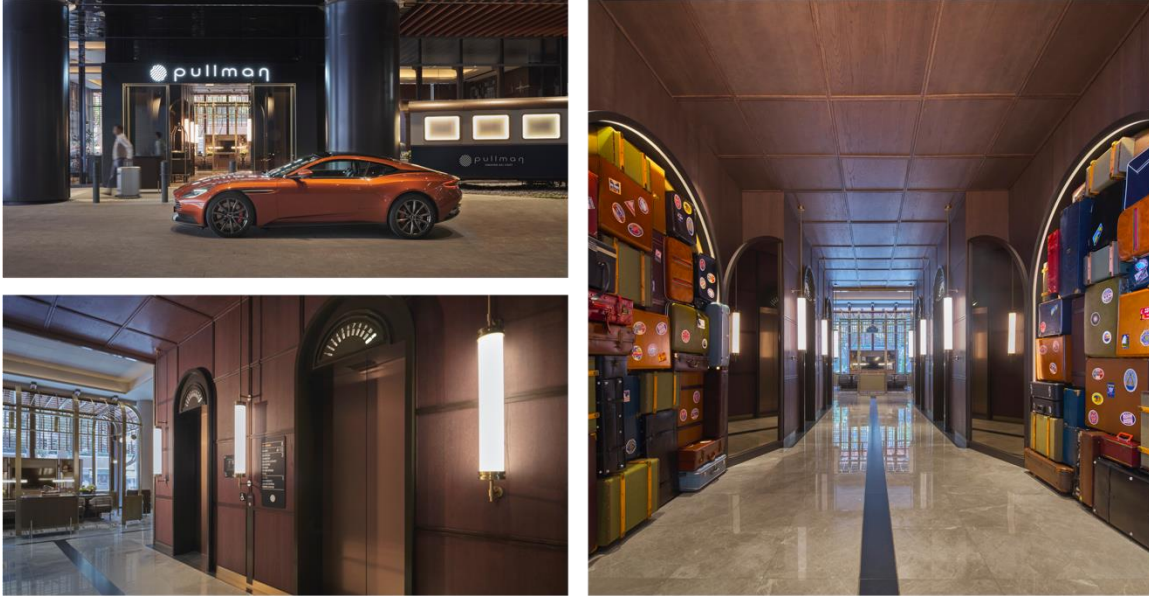
Clockwise above from top-left: The driveway, lobby feature wall, lobby elevators

Upon arrival, guests are first welcomed by Pullman Porters and a reproduction of a classic Pullman Sleeping Cabin, which functions as a luggage holding area. Enter the lobby and be greeted by a marble and wood-clad walkway flanked by a floor-to-ceiling installation of vintage carriers that lead the way to the antique-style elevators.