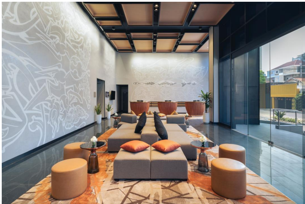
Phnom Penh, Cambodia – 29 th March 2024