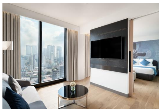
Executive Suite Room

Incorporating a modern, intuitive design, a relaxed social hub, and a range of dining and wellness options, this newly constructed hotel provides seamless experiences, enabling both business and leisure travelers to prioritize what matters most to them.