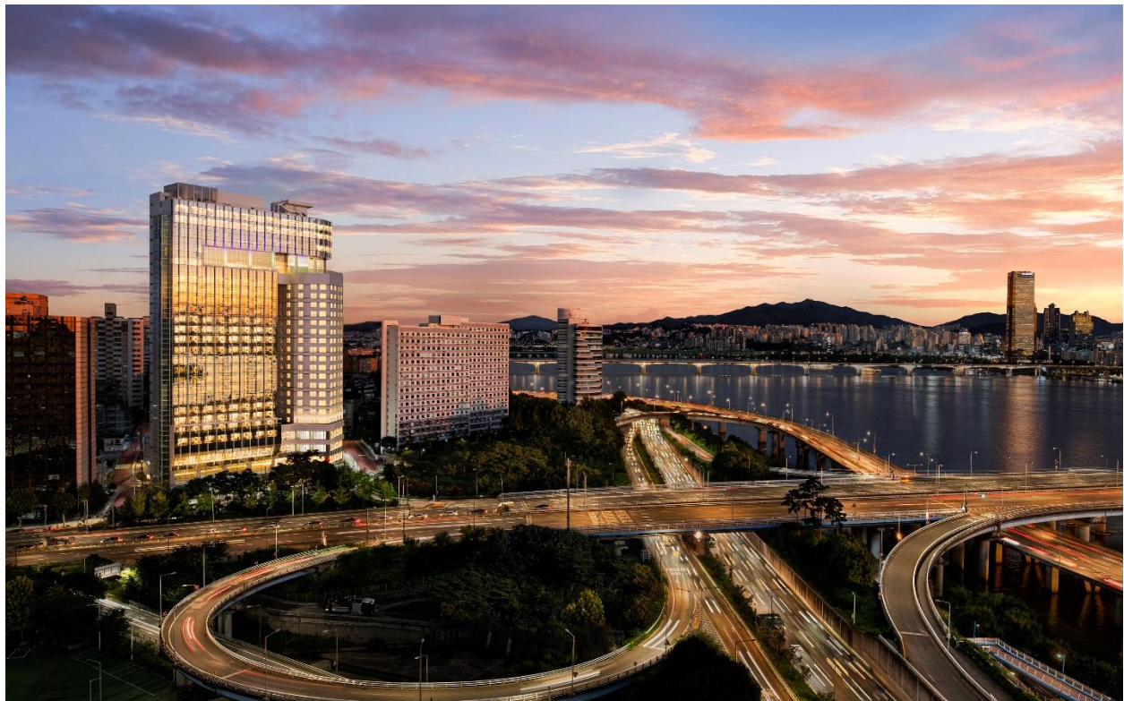
Above: Exterior of Hotel Naru Seoul – MGallery Ambassador

Hotel Naru Seoul – MGallery Ambassador opens with an array of unique stories to tell