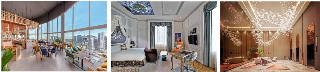
Left to right: SKAI at Swissôtel The Stamford, SO/Singapore, Sofitel Singapore City Centre

Playful local touches are infused with an edgy Parisian twist at SO/Singapore . Housed within a heritage building, the hotel is a spot for stylish socialisers to enjoy the dynamic blend of culture, cuisine and art. For those who look to indulge in the spirit of French art de vivre, Sofitel Singapore City Centre offers the luxurious comfort of French refinement. Within a short walking distance, a cultural connoisseur can explore the modern culture around the vibrant Tanjong Pagar neighbourhood.