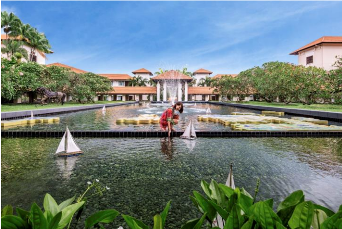
Left: Sofitel Singapore Sentosa Resort and Spa

Visitors to Thailand , South Korea , the Philippines and Bali can combine the offer with attractive discounts now available for a limited time, whilst guests of hotels in Cambodia and Malaysia can stack their rewards with special hotel credits. MasterCard holders can benefit from up to 30% off at participating hotels across Southeast Asia, Japan & South Korea with the Perfect Escape offer.