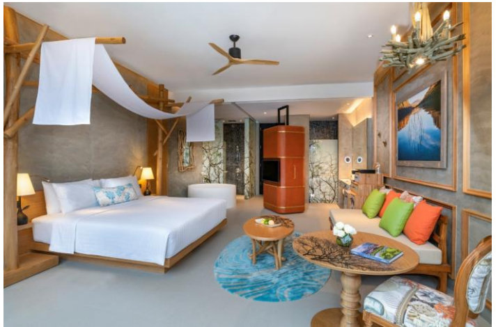
Right: SO/ Hua Hin, Thailand

Whether a staycation with friends or a short trip across the country with family, ALL is delighted to celebrate new beginnings with this auspicious 888 offer for its valued members. To take advantage of the best deals, join ALL – Accor Live Limitless and start earning points and other exclusive benefits. Membership is free of charge – visit www.all.accor.com