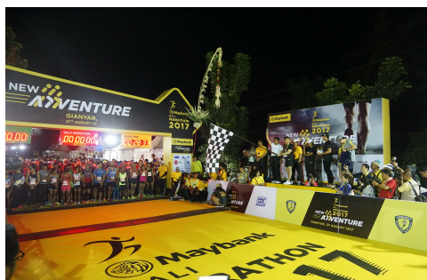
Maybank Marathon 2017 starting point. For high resolution version, click here .

Bali, Indonesia, 26th September 2017 - Mövenpick Resort & Spa Jimbaran Bali, the official partner of the Maybank Bali Marathon 2017, is giving sports fans of all ages and abilities the chance to stay active during their vacation.