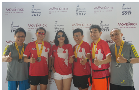
PT. Summarecon Agung Tbk. for Maybank Marathon 2017. For high resolution version, click here .