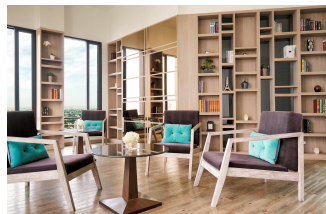
Stylish communal lounge. For high res image please click here .