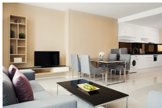
Spacious residences. For high res image please click here .

Mövenpick Residences Ekkamai Bangkok offers the best in contemporary comfort and convenience for long-term business and leisure travellers.